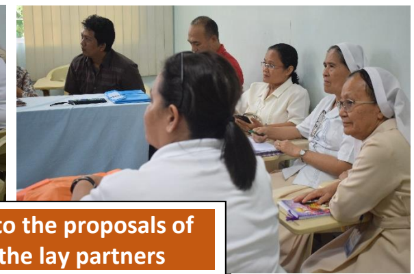
Intently listening to the proposals of the sisters and the lay partners