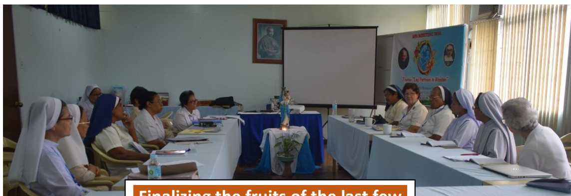
Finalizing the fruits of the last few days' sharing and listening