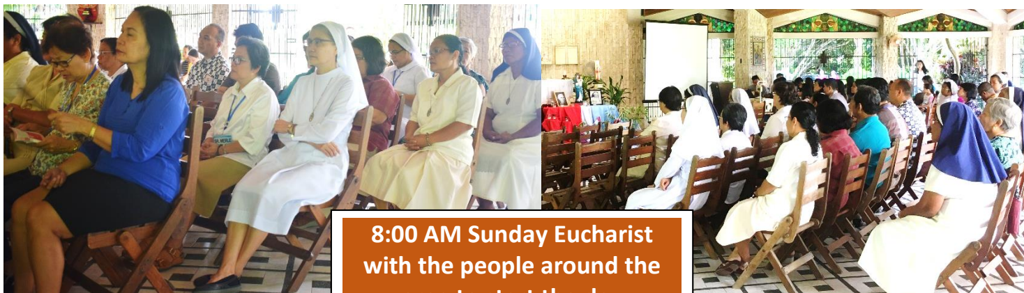
8:00 AM Sunday Eucharist with the people around the area to start the day