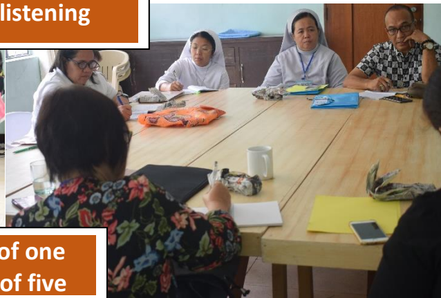
Minimum of one Maximum of five