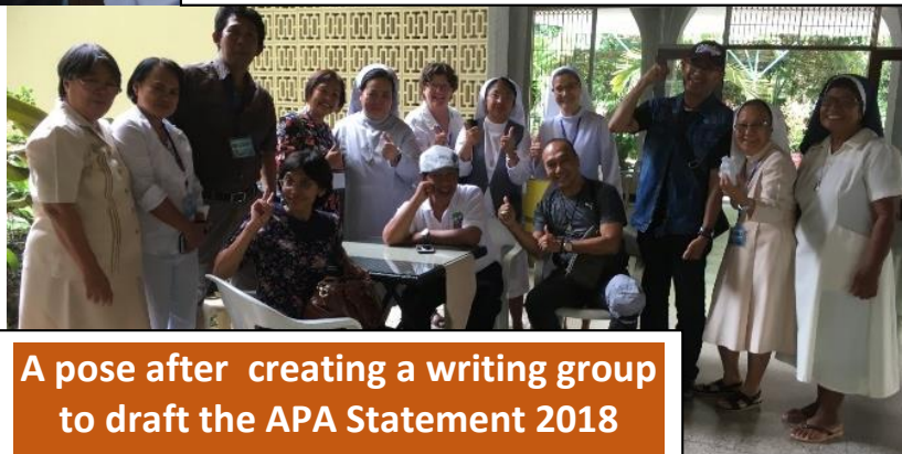
A pose after creating a writing group to draft the APA Statement 2018