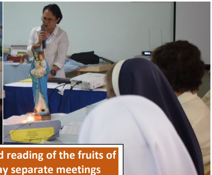
Reporting and reading of the fruits of 1 and ½ day separate meetings