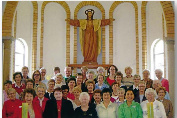
Australian OLSH Associates at an Annual Retreat

New members are usually attracted to the Associates through the experience of seeing the Charism in action in the lives of other Associates. They are invited into a group and after an extended period of formation make their Commitment when ready.