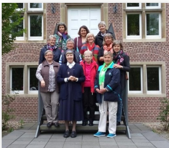
German participants at the Whitsun meeting in Kleve 2016

There are two lay groups in Germany. In Duisburg/Dinslaken we have 20 women and in Pfaffrath a smaller group of three women came into being. The groups have monthly meetings and at least once a year they have contact together. Both groups are accompanied by MSC sisters. The lays are responsible for the organisation and the contents of the meetings.